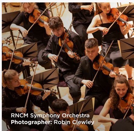
RNCM Symphony Orchestra

Mendelssohn's Elijah presented by Salford Choral Society