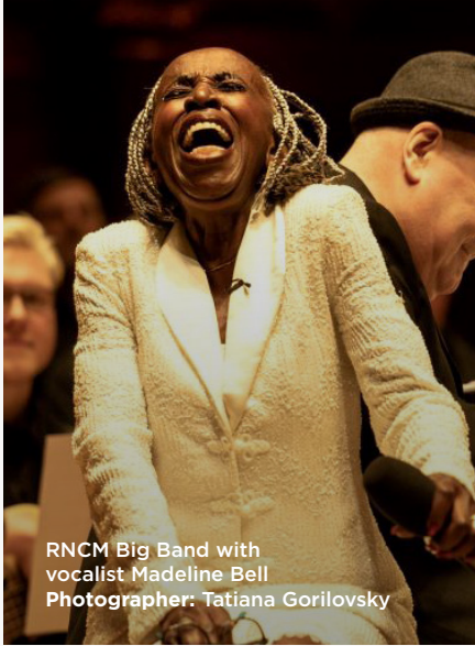
RNCM Big Band with vocalist Madeline Bell