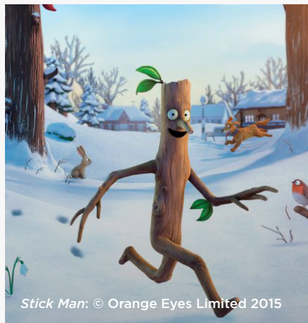
Stick Man: © Orange Eyes Limited 2015